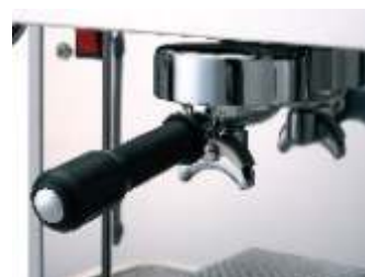
High Quality Components

Mono is highly suitable for the smaller café or bar that wishes to serve espresso, cappuccino and other espresso based drinks. And thanks to its tried and tested technology along with craftsman build quality you can count on years of trouble free service.