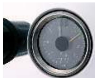
Dual Pressure Gauge