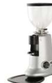
Expobar 600 Grind On Demand