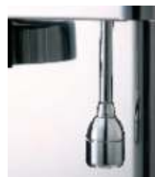
Hot Water Outlet