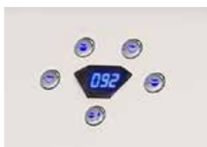
Digital display for temperature in brew group