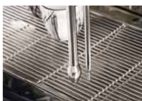
Steam arm with temperature sensor