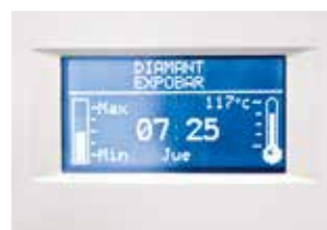
The information display provides valuable data, including the water level in the steam tank