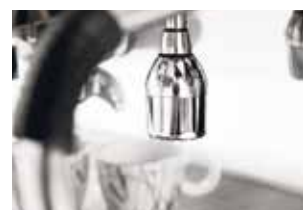
Automatic hot water dispenser